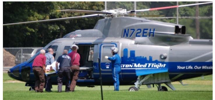
The Sikorsky S76 - is loaded from the left side.