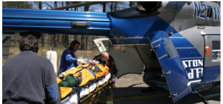
The BK 117 - is loaded from the rear of the aircraft.